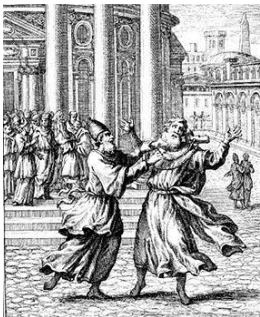
Jeremiah gets released by Hananiah