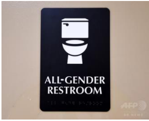
The sign of a bathroom for homosexual people