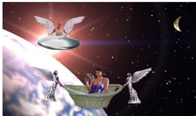
A woman sitting in the ephah

It is quite obvious. You need to throw away the teachings of all kinds of thieves. Pre-rupture theory and two step rapture theory are the prime examples. The wrath of God is piling up because of these teachings of thieves and you need to be aware of that.