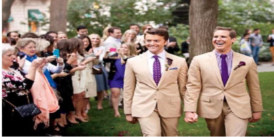
American homosexual couple

be killed. So, we shouldn't stay at such rebellious churches and instead go into the underground churches.