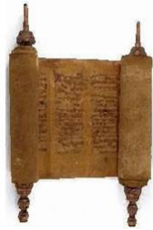
Breaking the seven seals

<What I learnt from a robe from Babylonia>